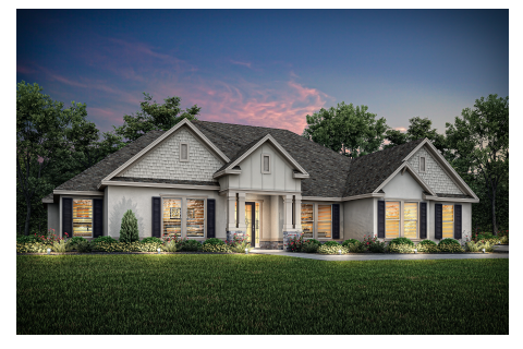
Built on an acreage homesite, the Mantle showcases a media room, a formal dining room, a covered outdoor kitchen and a 3-car garage.

outfitted with a host of designer upgrades including a full suite of stainless steel kitchen appliances, quartz countertops, 42" upper cabinets with crown molding, gorgeous luxury vinyl plank flooring, beautiful light fixtures, blinds throughout, finished garages with epoxy flooring and covered outdoor kitchens.